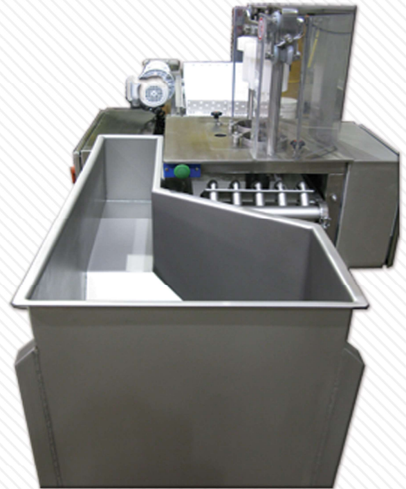
Pre-Wash Feed Trough