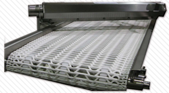
Air Knife Option

Capacity: Up to 1200 pieces / hr. Width: 33 inches Length: 98 inches Height: 72 inches Utilities: 230V / 60 Hz / 3 Phase / 15 Amp 460V / 60 Hz / 3 Phase / 8 Amp Tank Capacity: Recirculation tank - 12 gal. Treatment tank - 10 gal. Total Weight: 800 lbs.