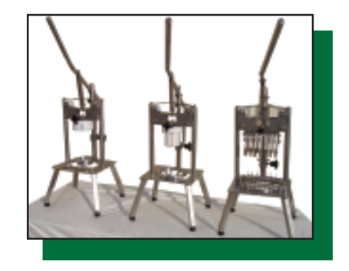
F1000-G pineapple system