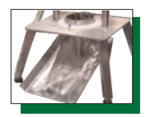
Divider pan separates product from