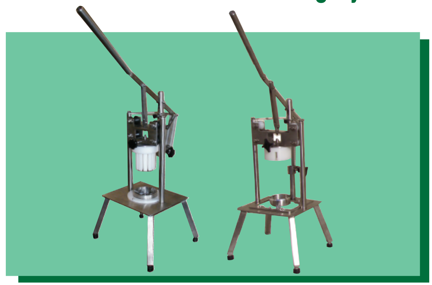
F1000 / F1000-G Manual Cutting System — great for small jobs

The F1000 is a manual cutting system perfect for slicing, wedging, wedge/core, petal cuts and more in a small space. With the ability to process up to 24 pieces per minute, the F1000 can be the perfect system for a fast, convenient, easily storable work station set up.